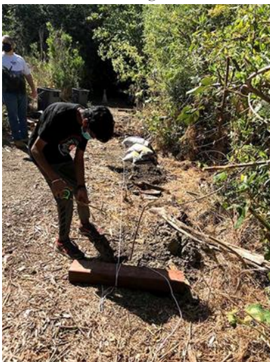
Trail with Retaining Wall – Tule Ponds

Furthermore, I struggled in planning and executing a service project, which is one of the hardest and most important requirements in becoming eagle. I had spent months reaching out to many people around my community and most of them were not having a project I can do. I looked all over the web to find some idea about a project I could perform and was not getting any idea about this. After multiple calls and emails to nonprofit organizations, I decided to send an email to a museum director asking if she had some project, she needed help with. The next morning, she invited me to the tule ponds and showed me many woodworking projects. I was very hesitant on my woodworking skills and was not sure whether the projects she suggested were something I can plan. I decided to build a retaining wall near a tractor path. The purpose of this wall was to block off floods and keep children safe on the trail. I had spent months planning and getting approved by the troop and district. I had finally gotten my approvals after few months. Then I needed to start collecting donations, calling hardware shops, and asking whether they would be willing to provide discounts for a service project.