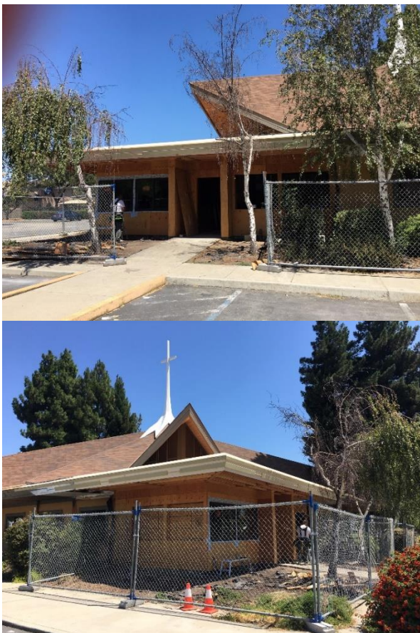
FIRE REPAIR PROGRESS 7-30-2020