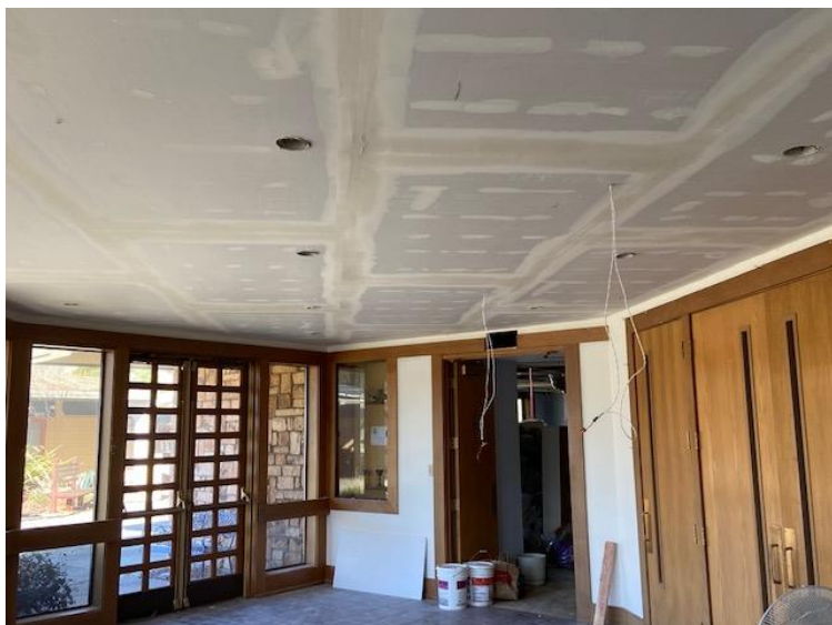
(Clockwise from upper left) Door entrance to sanctuary building by the office; looking down hallway towards the Narthex; the office; the Narthex; the Pastor's office (texture being applied on drywall)

Completion of mechanical duct work and t-bar ceiling are scheduled next. Electrical contractor will be completing modification of Narthex lights and door entry lights. 1-31-2021