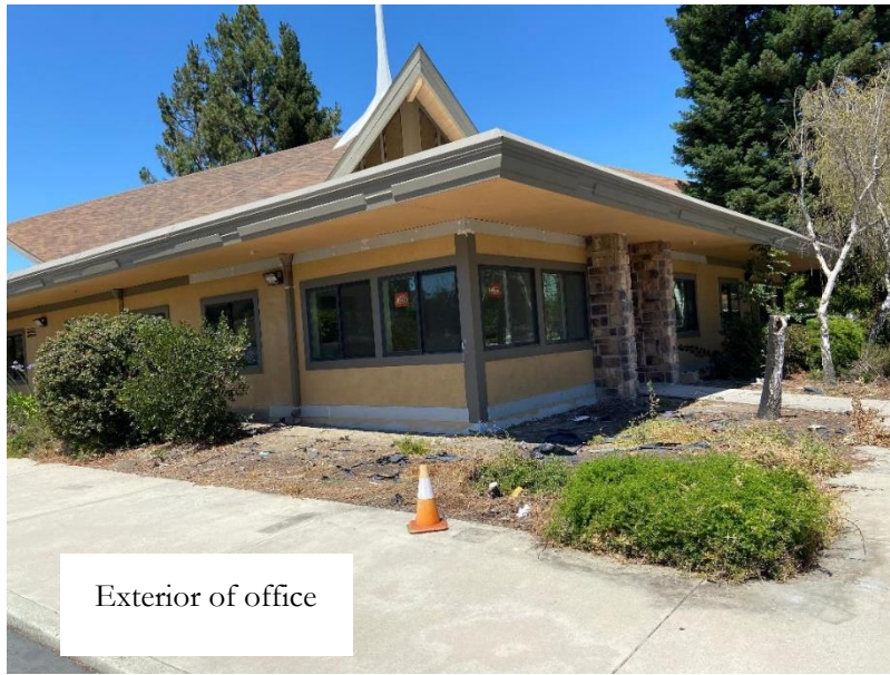
Exterior of office