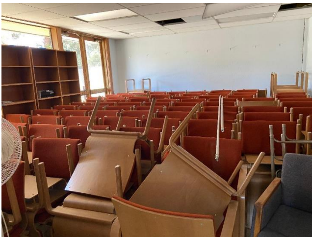
Old carpet (upper left)