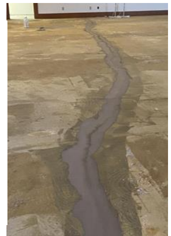
The library (lower left)